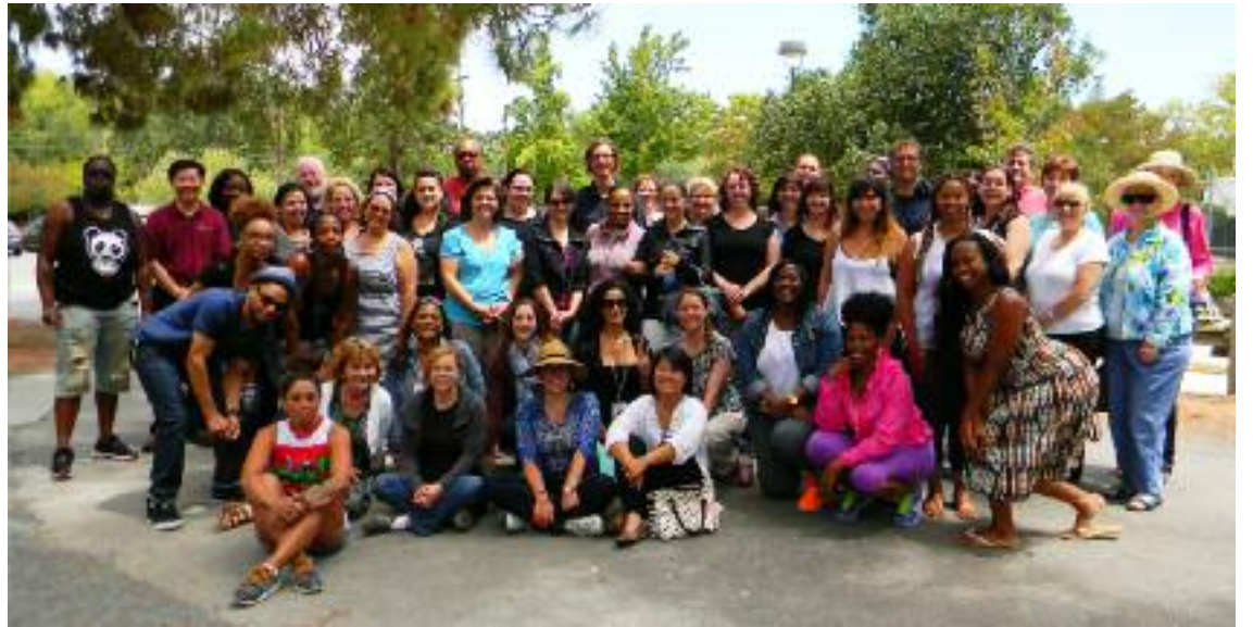
Youth Homes staff at their annual summer barbecue